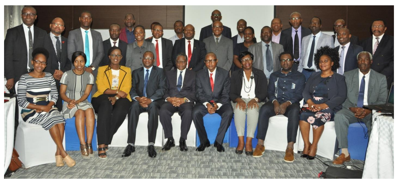
Group photo at the official opening of the roundtable meeting held on 14-15 December 2017 in Kigali, Rwanda.

Report on the roundtable meeting organized by Aidspan 14-15 December 2017